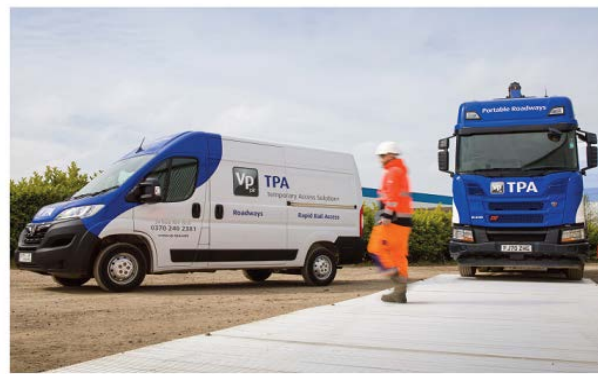
Vp plc TPA Temporary Access Solutions