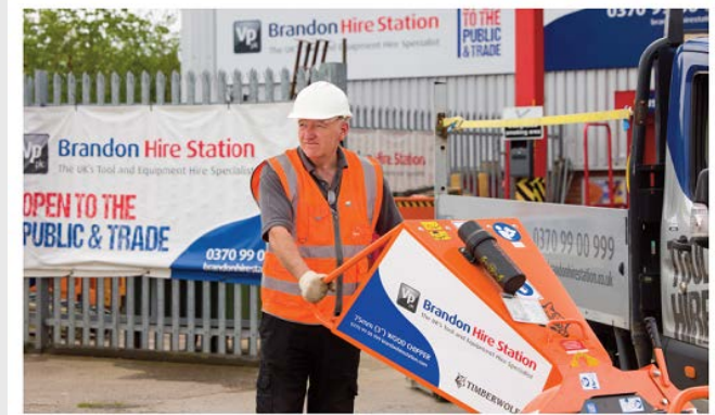
Vp plc Brandon Hire Station The UK's Tool and Equipment Hire Specialist