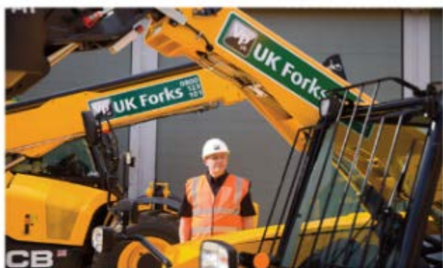
Vp plc UK Forks Materials Handling Specialists