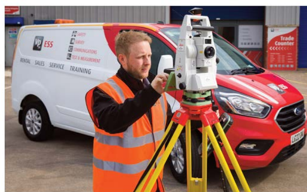
Vp plc ESS Safety, Survey, Test & Measurement