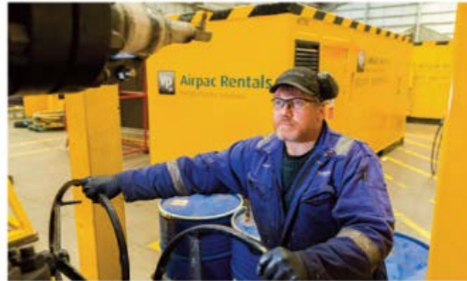
Vp plc Airpac Rentals Energy Industry Solutions