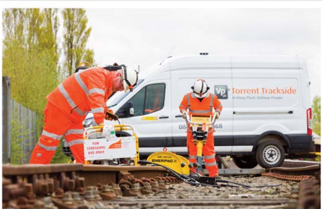
Vp plc Torrent Trackside Railway Plant. Railway People.