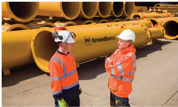
Vp plc Groundforce Specialist Construction Solutions