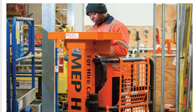
Vp plc MEP Hire Mechanical, Electrical & Low Level Access Specialists